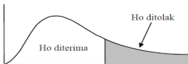
Figure 2. 95% Confidence Level F Test

Seen in table 2 the significant value for the effect of budget participation ( X_1 ), accountability accounting ( X_2 ) and motivation ( X_3 ) on managerial performance ( Y ) is 0.000 < 0.05 and F_{count} 388.931 > F_{table} value 2.42. This proves that H_0 is rejected and H_a is accepted.